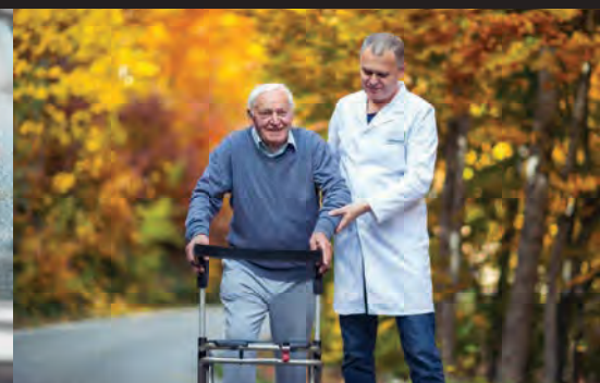
Long-term care facilities