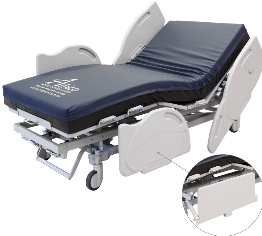
Metal Siderails Available