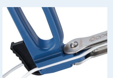
Unique locking handle allows total control of uterine position