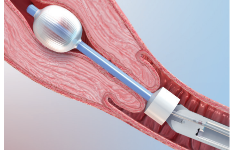
Saline inflated tip provides a firm hold for superior manipulation Easy load Koh-Efficient is engineered for easier insertion Koh-Efficient provides an ideal visual landmark for dissection

A key challenge in total laparoscopic hysterectomy is the identification, management and safekeeping of the ureters and uterine arteries during the procedure. The RUMI II / Koh-Efficient is designed to fit securely over the cervix to place the vaginal fornix on stretch. The delineation provides a visual landmark and backstop for dissection while distancing the colpotomy incision from the ureters. This creates a 'margin of safety' allowing you to continue the procedure with confidence. The locking handle maintains tip orientation and uterine position — both crucial to the success of the procedure.