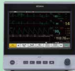
X10 Patient Monitor