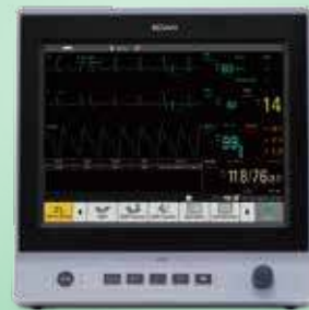
X12 Patient Monitor