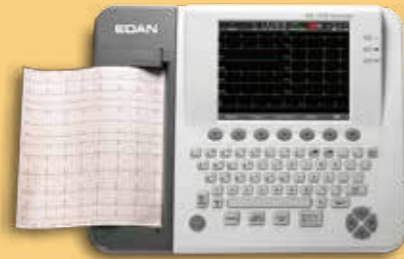
SE-1200 Express Electrocardiograph