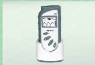
Battery Charger Stand