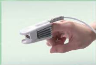
Unique Sensor Design