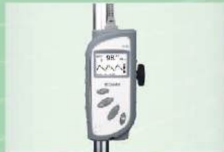
Bed Rail Mount