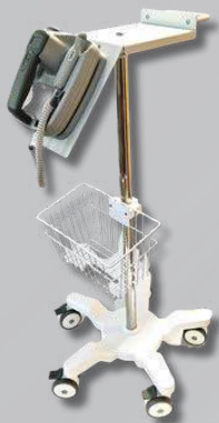
Roll Stand (STND-101)