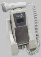
Recharging Wall/Table Base (ACC-111)