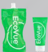
Ultrasound Gel 8.8oz | 2.1oz (GEL-110) (GEL-100)