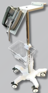
Roll Stand (STND-121)