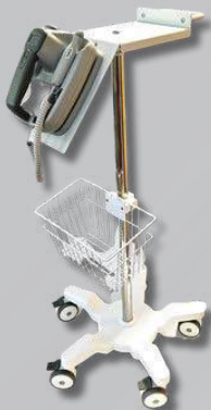
Roll Stand (STND-121)