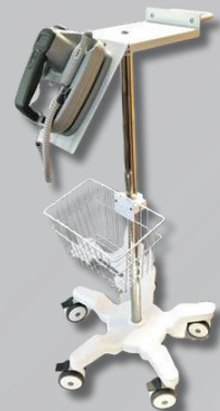
Roll Stand (STND-121)