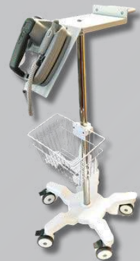
Roll Stand (STND-131)