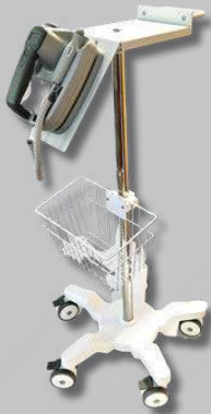
Roll Stand (STND-121)