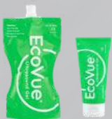
Ultrasound Gel 8.8oz | 2.1oz (GEL-110) (GEL-100)