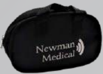
Carry Bag (ACC-170)