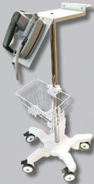
Roll Stand (STND-121)