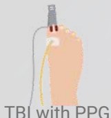
TBI with PPG