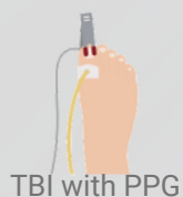
TBI with PPG