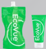
Ultrasound Gel 8.8oz | 2.1oz (GEL-110) (GEL-100)