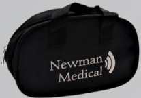
Carry Bag (ACC-170)