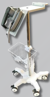
Roll Stand (STND-111)