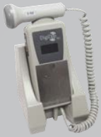
Recharging Wall/Table Base (ACC-111)