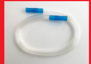
#43203 - 3 Feet