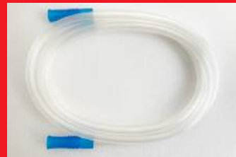
#43200 - 6 Feet

For best results, use SSCOR #43200 OR #43203 patient connecting tubing. Both have a large internal diameter similar to the SSCOR DuCanto Catheter.