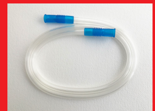
#43203 - 3 Feet