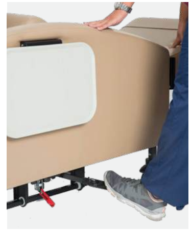
Foot lever for exclusive Secure-Glide™ Trendelenburg descent