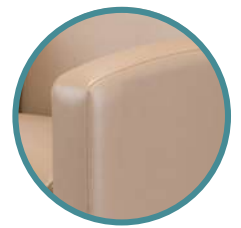
Push Back 5X and 6X models