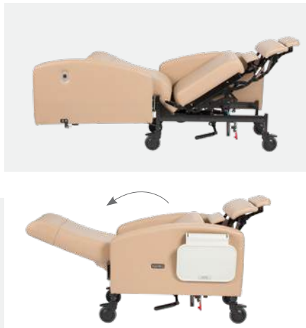
Secure-Glide™ for stress-free positioning

Exclusive to Verō , Secure-Glide™ provides gentle patient positioning while avoiding injury to caregivers. The controlled descent helps eliminate any need or natural reflex to manually control the rapid patient descent in emergency situations.