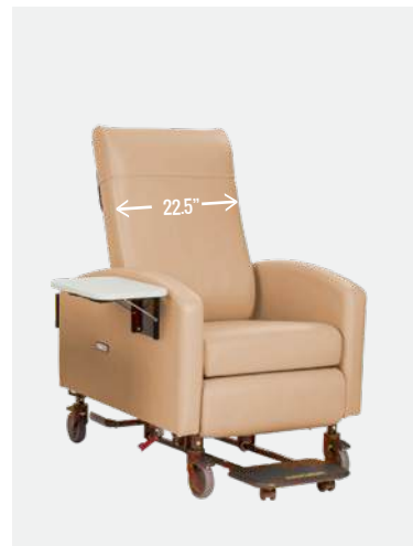
Standard 350 lb Capacity