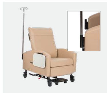
IV Holder Mount Available for left, right or both sides