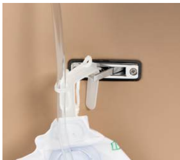
Accessory Hook Shown here with Foley bag

CONVENIENTLY PLACED CONTROLS FOR PATIENT INDEPENDENCE