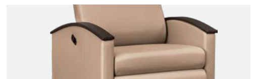
Urethane Arm Cap Option

Urethane Cap Option Urethane arm caps provides a unique, upscale appearance and added durability.