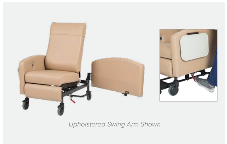
Upholstered Swing Arm Shown

Fixed Arm Option Fixed arms are suitable for most general purpose operations when transfer of patient is not required or where working space is limited.