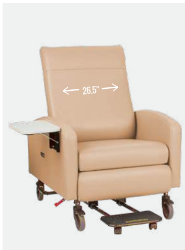
X-Large 500 lb Capacity