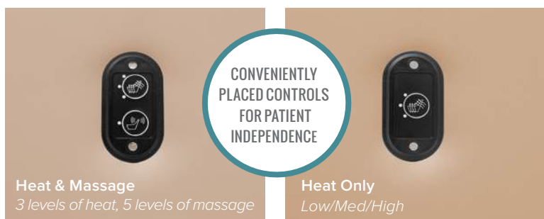
Heat & Massage 3 levels of heat, 5 levels of massage