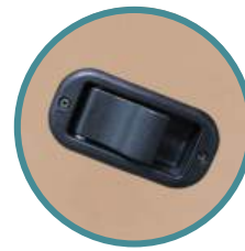
Gas Assist 5X and 6X models