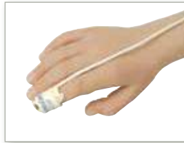
7000P Pediatric (> 10 kg / 22 lbs)