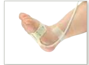
7000N Neonatal Neonate: (< 2 kg / < 4.4 lbs) Adult: (> 30 kg / > 66 lbs)

All sensors are packaged in 24-pack cartons. Use only with Nonin pulse oximetry.