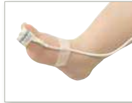
7000I Infant (2-20 kg / 4.4-44 lbs)