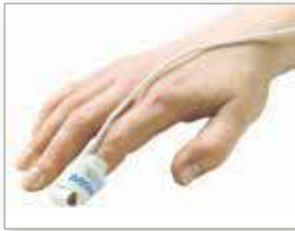
7000A Adult (> 30 kg / > 66 lbs)